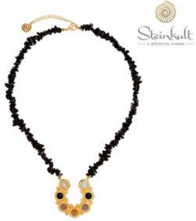
LENGTH ADJUSTABLE 40-50 CM H30256 ACHG