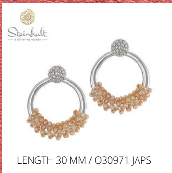
LENGTH 30 MM / O30971 JAPS