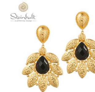
LENGTH 70 MM / O30251 OXG