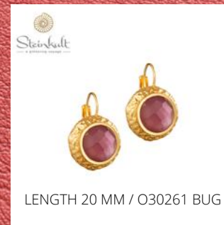
LENGTH 20 MM / O30261 BUG