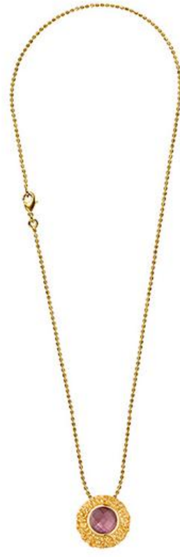
LENGTH 42 CM / H30259 BUG