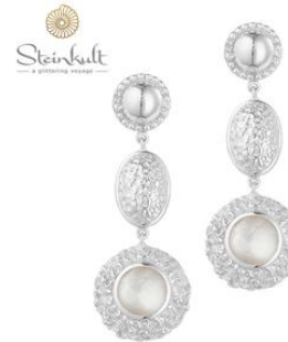
LENGTH 55 MM / O30262 WOS