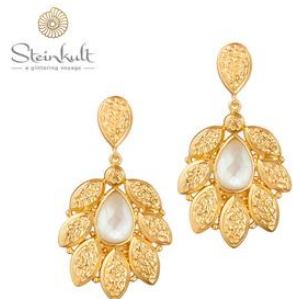
LENGTH 45 MM / O30252 WOG