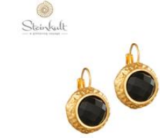
LENGTH 22 MM / O30261 OXG