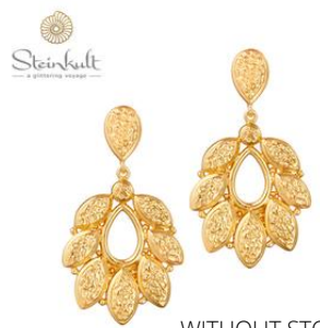
WITHOUT STONE LENGTH 45 MM / O30252 G