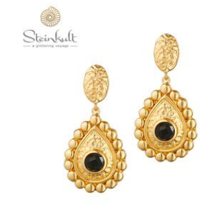
LENGTH 40 MM / O30254 OXG