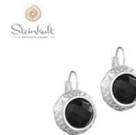
LENGTH 22 MM / O30261 OXS