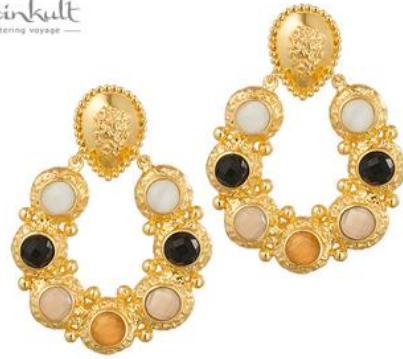
LENGTH 55 MM / O30255 ACHG