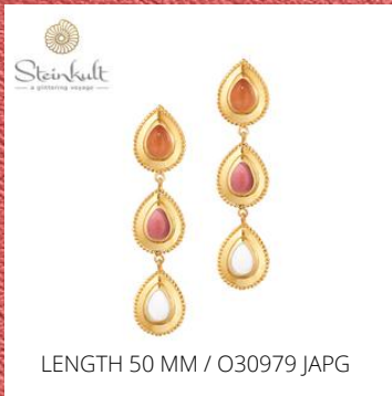
LENGTH 50 MM / O30979 JAPG