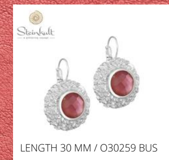
LENGTH 30 MM / O30259 BUS