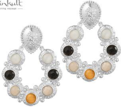
LENGTH 55 MM / O30255 ACHS