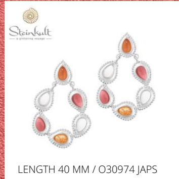
LENGTH 40 MM / O30974 JAPS