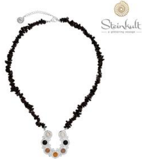
LENGTH ADJUSTABLE 40-50 CM H30256 ACHS