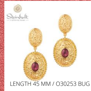
LENGTH 45 MM / O30253 BUG