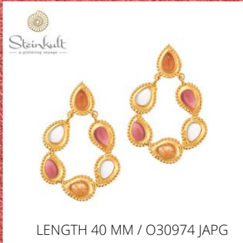
LENGTH 40 MM / O30974 JAPG