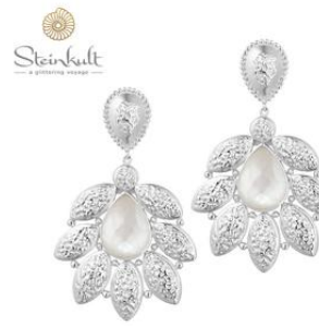
LENGTH 70 MM / O30251 WOS