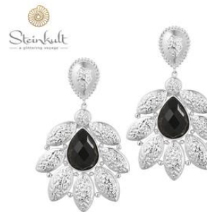
LENGTH 70 MM / O30251 OXS