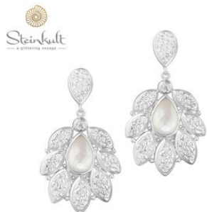
LENGTH 45 MM / O30252 WOS