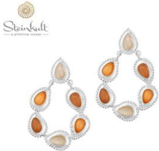
LENGTH 40 MM / O30974 YOXS