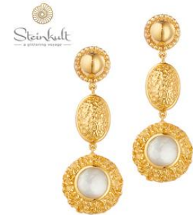
LENGTH 55 MM / O30262 WOG