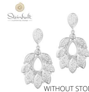
WITHOUT STONE LENGTH 45 MM / O30252 S