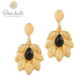
LENGTH 45 MM / O30252 OXG