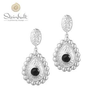
LENGTH 40 MM / O30254 OXS