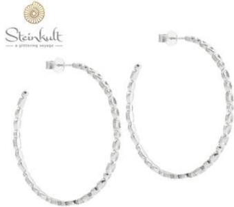
AVAILABLE IN 2 SIZES: 55 MM / O30960 S 30 MM / O30960-B S