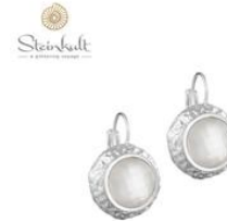
LENGTH 22 MM / O30261 WOS