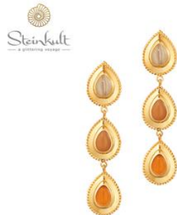
LENGTH 50 MM / O30979 YOXG