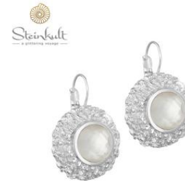
LENGTH 30 MM / O30259 WOS