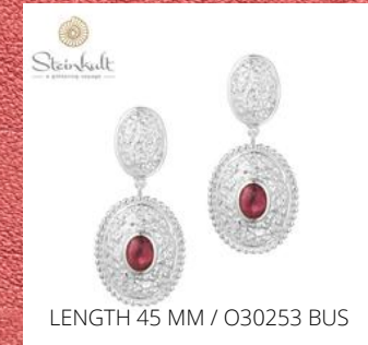
LENGTH 45 MM / O30253 BUS