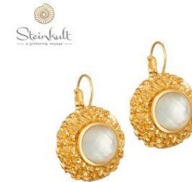
LENGTH 30 MM / O30259 WOG