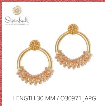
LENGTH 30 MM / O30971 JAPG