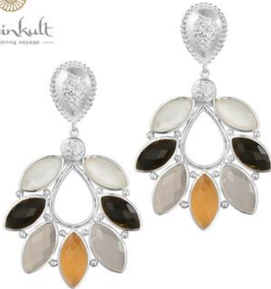
LENGTH 70 MM / O30250 ACHS