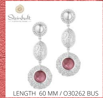
LENGTH 60 MM / O30262 BUS