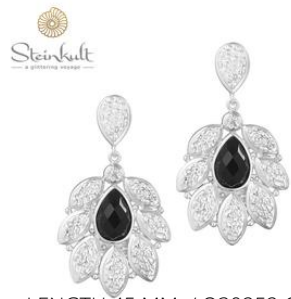
LENGTH 45 MM / O30252 OXS