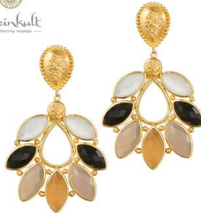
LENGTH 70 MM / O30250 ACHG