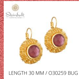
LENGTH 30 MM / O30259 BUG