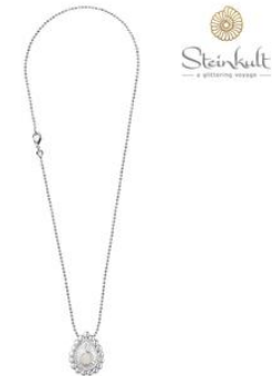
LENGTH 42 CM H30260 WHS