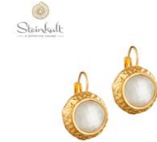
LENGTH 22 MM / O30261 WOG