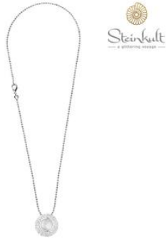
LENGTH 42 CM H30259 WHS