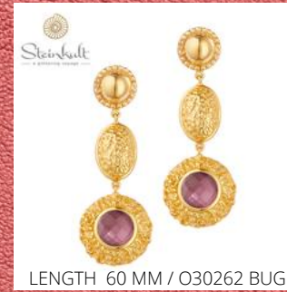
LENGTH 60 MM / O30262 BUG