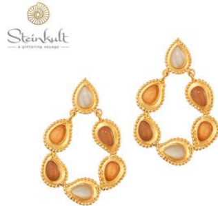
LENGTH 40 MM / O30974 YOXG