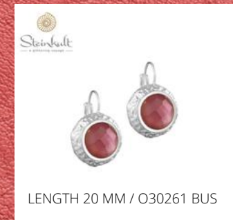
LENGTH 20 MM / O30261 BUS