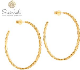
AVAILABLE IN 2 SIZES: 55 MM / O30960 G 30 MM / O30960-B G