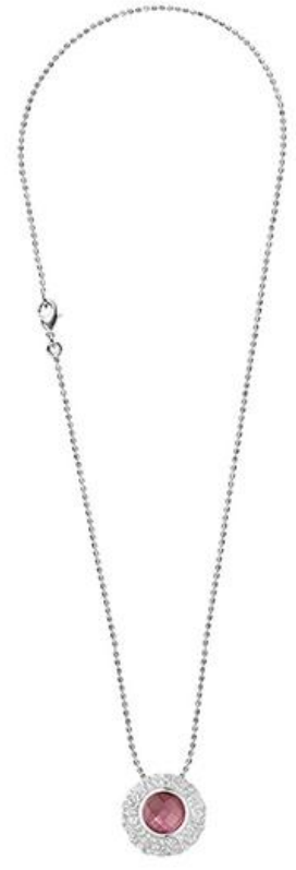
LENGTH 42 CM / H30259 BUS