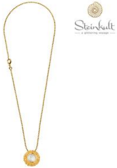
LENGTH 42 CM H30259 WHG