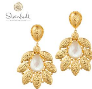
LENGTH 70 MM / O30251 WOG