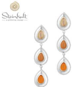
LENGTH 50 MM / O30979 YOXS