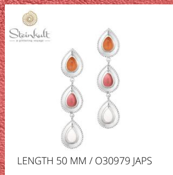
LENGTH 50 MM / O30979 JAPS